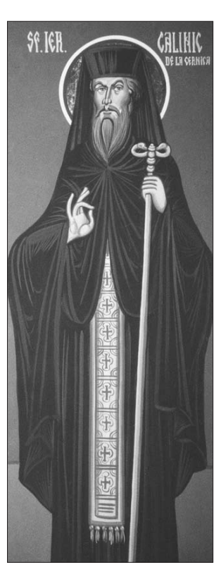
Saint Calinic of Cernica

Owing to opposition from the Hierarchy of that time, another, more effective strategy was devised: it was decreed that all Hierarchs were to be licensed in theology at foreign institutions. Thus, Miron (Cristea) (1868–1939), the future Metropolitan Primate and Patriarch of Romania,<sup>3</sup> was