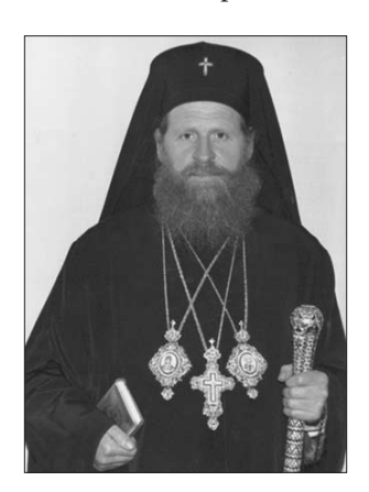
Archbishop and Metropolitan Vlasie of Romania

With Hierarchical blessings and gratitude to all of those who labored on this publication,